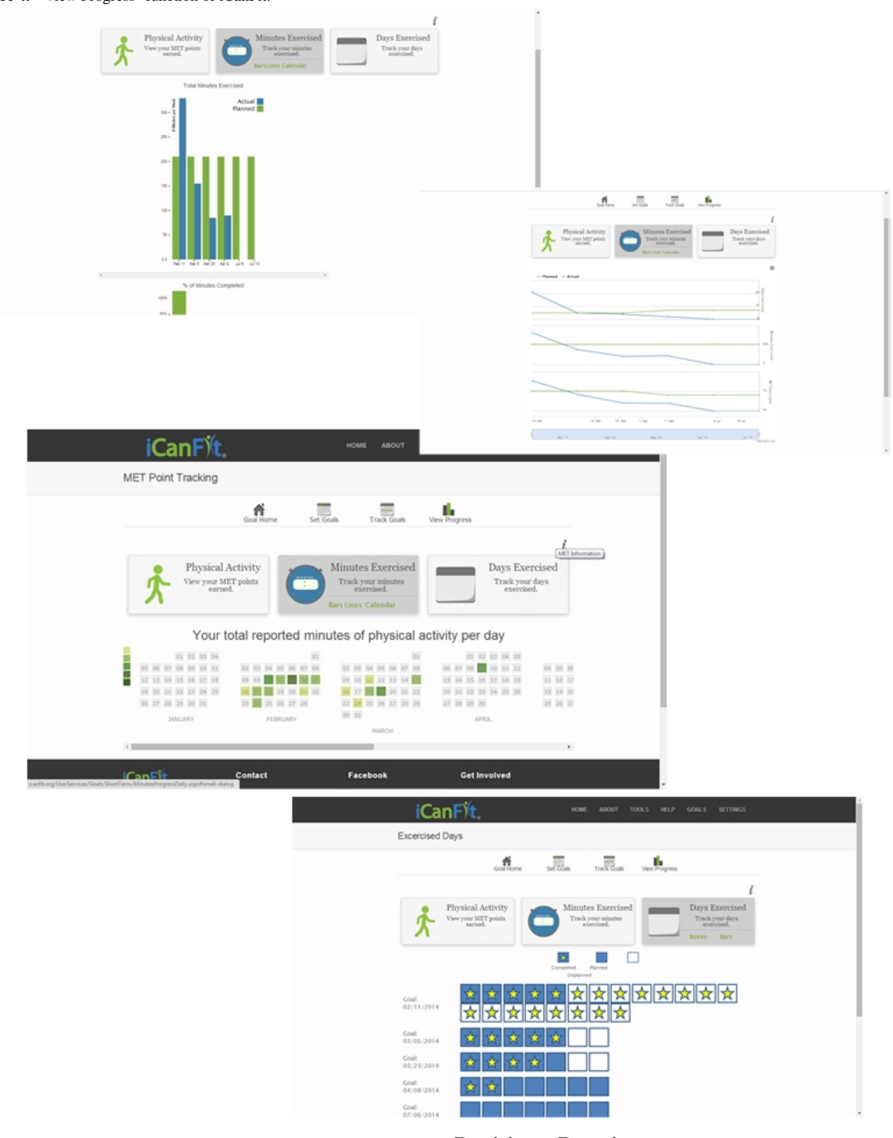
Figure 4. "View Progress" function of iCanFit.